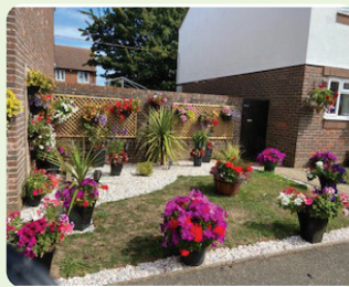
Class 3 Winner - 16 Goodwood Close

The Awards will be presented at the Reception following the Council's Annual Civic Thanksgiving Service in September (subject to the Covid-19 Restrictions being relaxed sufficiently enough) or alternatively, in person by the Chairman and/or Vice-Chairman of the Council.