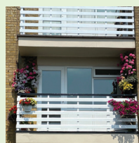
5 Ashwood Drive