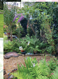
The Hidden Twitten