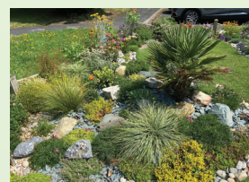
64 Dinsdale Gardens