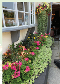
The Lamb Public House