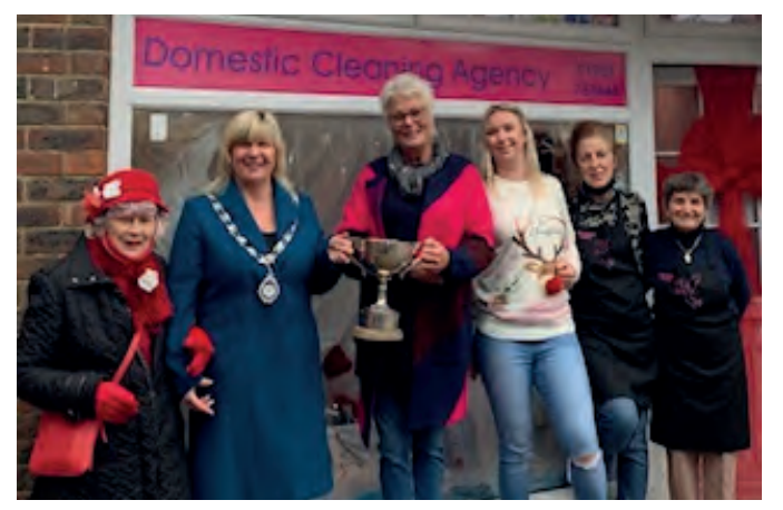
Christmas Shop Window Competition Winner - Little Angels Ironing Shop

Welcome to our Winter Newsletter, which we hope you will enjoy.