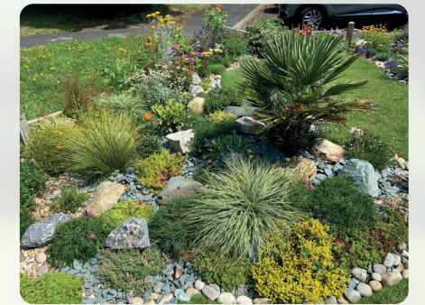
2021 Winner 64 Dinsdale Gardens