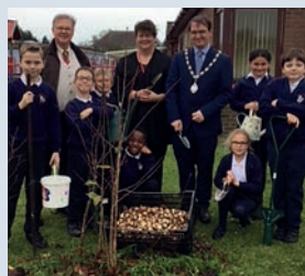
Georgian Gardens CPS