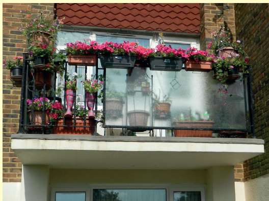
2017 Class 1 Winner - 12 Whitecroft, Ash Lane

The closing date for the receipt of Nomination Forms is 20 June. The Awards will be presented at the Reception following the Council's Annual Civic Thanksgiving Service in September.