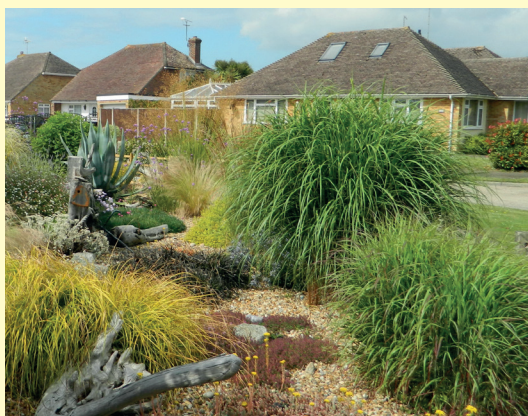
2017 Class 3 Winner - 7 Andrew Close