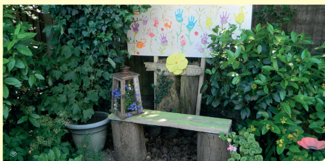
2018 Class 6 Winner - The Hidden Twitten (rear of Herne Gardens/Orchard Gardens Garage Compound)