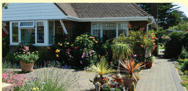
2018 Class 3 Winner - 37 Knightscroft Avenue

The Awards will be presented at the Reception following the Council's Annual Civic Thanksgiving Service in September.